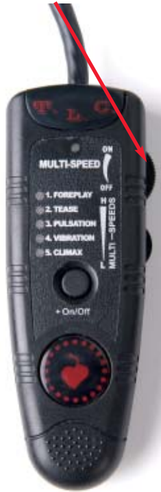
Remote control unit

You control the speed of this action by turning the dial up or down.