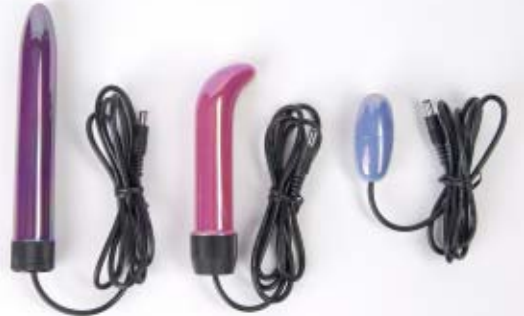
Slimline Vibe G-Spot Vibe Vibrating Love Bullet®

1. To make your Love Machine™ experience even more enjoyable, T.L.C.® has included three vibration and pulsation accessories!