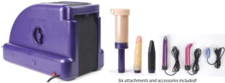
Six attachments and accessories included!

Your Love Machine™ comes fully assembled! Simply connect your desired attachments.